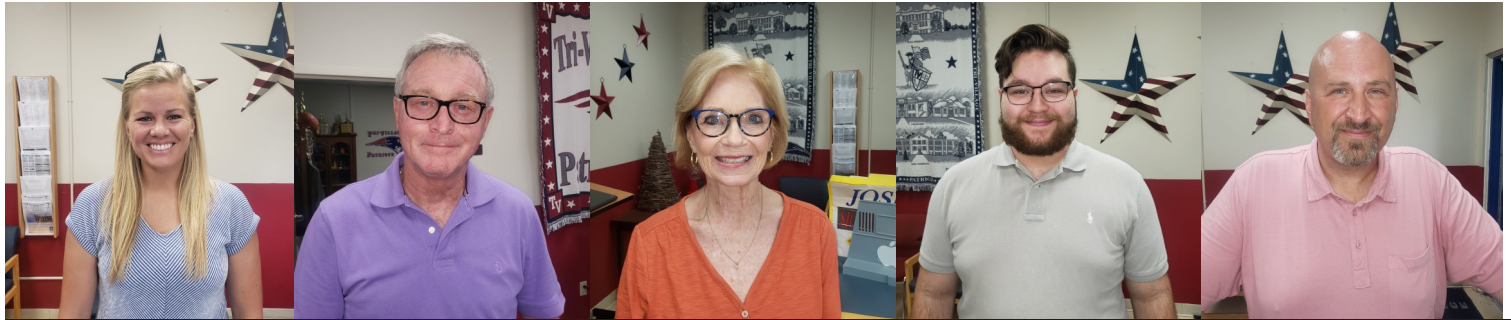
Mrs. Amanda Ernst Kindergarten